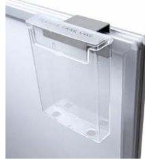
(WTGHOD) LEAFLET HOLDER PROSPEKTHALTER