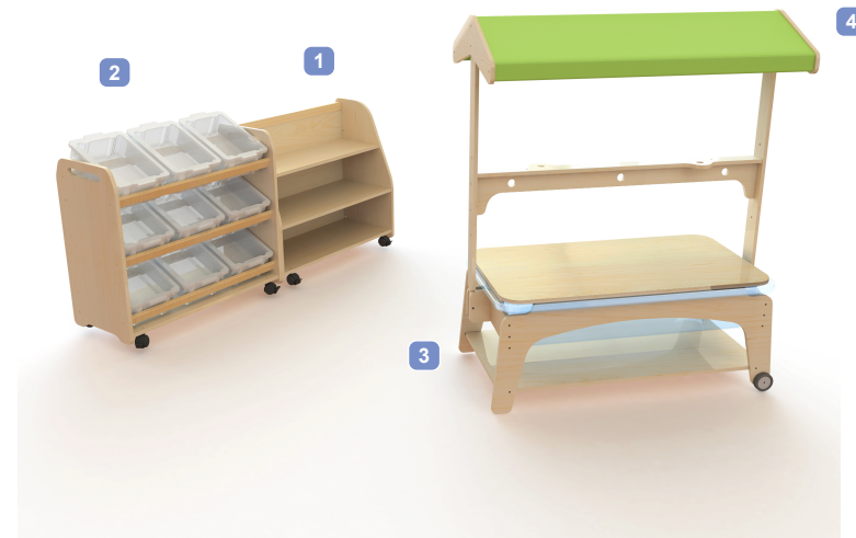
3D CAD Drawing