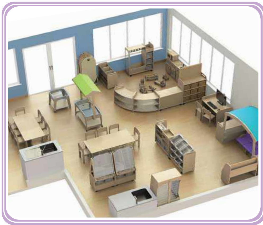
Indoor Room Planning

So, let us take the hassle out of the project for you, and give us a call on 0800 612 5432 or email sales@boardsdirect.co.uk to discuss your requirements.