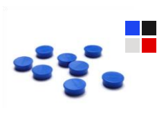
(MAGNETS) MAGNETS MAGNETE