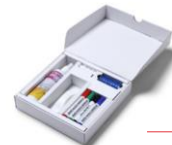
(STARTERKIT) STARTERKIT STARTPACKUNG