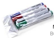
(SETFIXWB) MARKER PENS BOARDMARKER