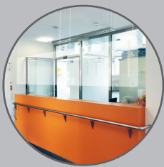
Also ideal in the hospital!