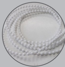
Incl. white plastic chain