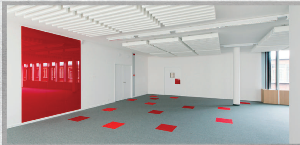
(Top and Middle) Magnetic glass boards with digital print (Bottom) Creative Wall in 'Red Luminous'